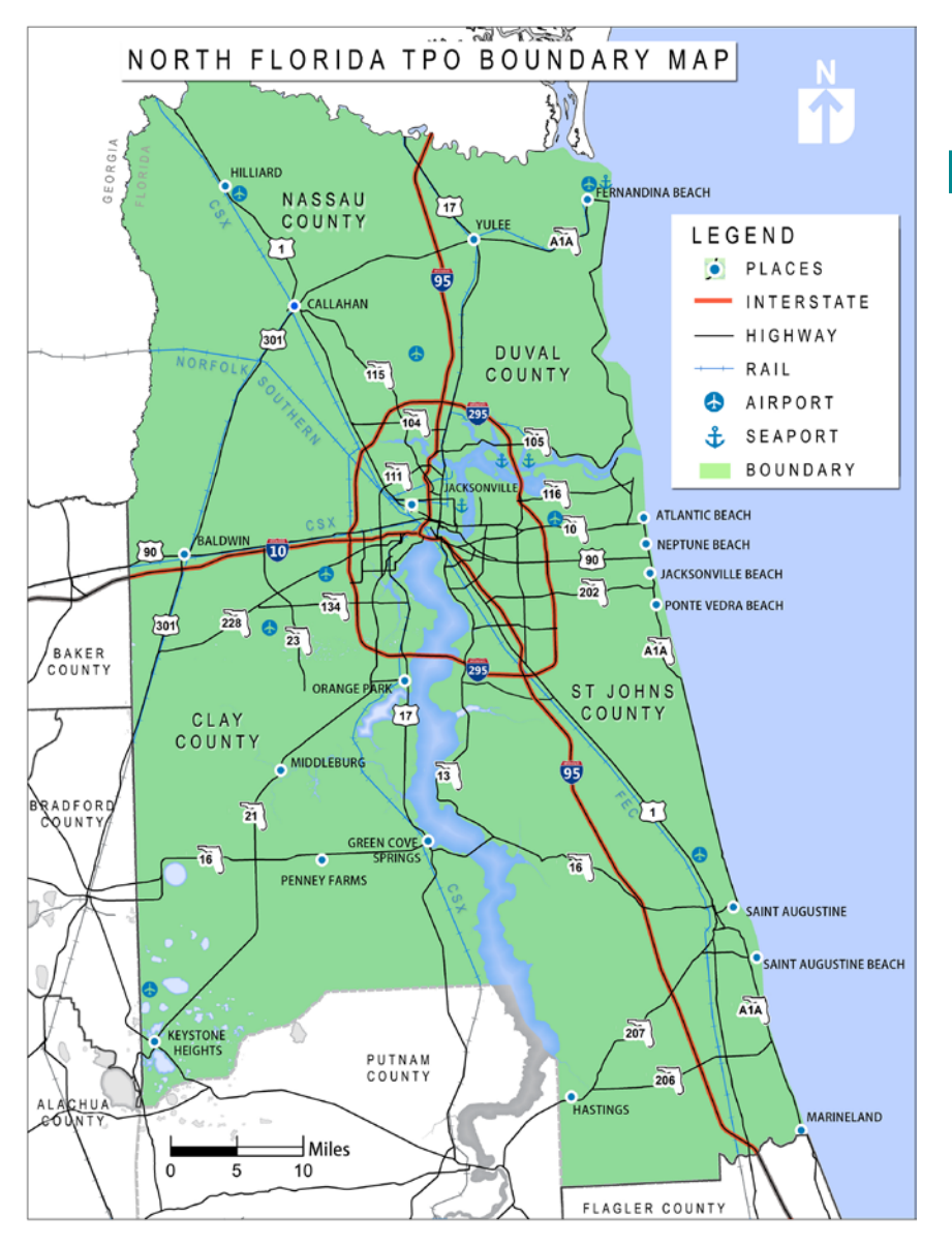
Figure 1 Boundary Map